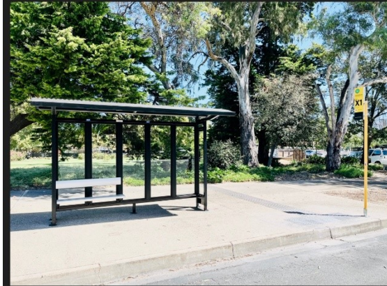
Stop X1 Dequetteville Terrace – Southwest Side