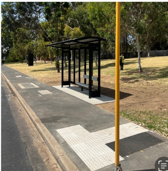
Stop 1 Botanic Road – Southeast Side (opposite the National Wine Centre)

Two bus shelters were renewed in March; Stop X1 Dequetteville Terrace – Southwest Side and Stop 1 Botanic Road – Southeast Side (opposite the Wine Centre).