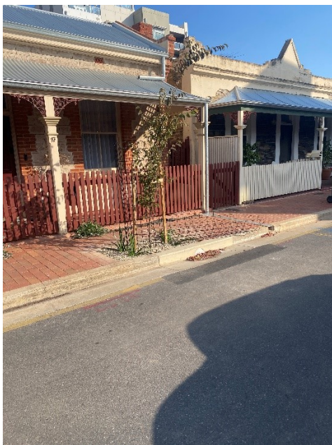
Hamilton Place Greening

Greening installations on Tapley Street, Brougham Place, Cairns Street and Gray Street have been completed.